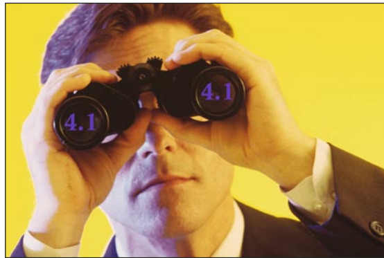
Enhancements to Accounts Receivable, Sales Order, Bank Reconciliation, and Return Merchandise Authorization modules give you much to look forward to in Version 4.1.

The Grid Entry system results in near limitless data entry flexibility. Where appropriate,