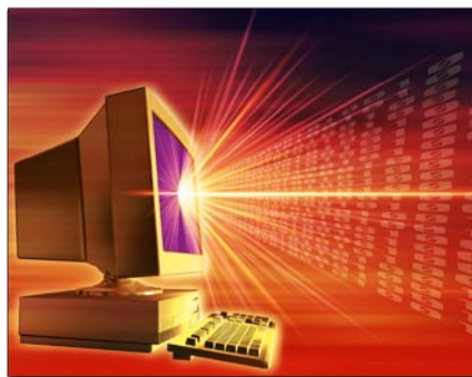
Supercharge your MAS 90 software with the new Windows Scripting capabilities

You will need to own the Customizer module, be running Version 3.71, and Microsoft Windows Scripting Host must be installed and operational. If you plan to create your own scripts, a good working knowledge of VBScript (Visual Basic Script) and/or Jscript (Microsoft's version of JavaScript) is also a requirement. But don't